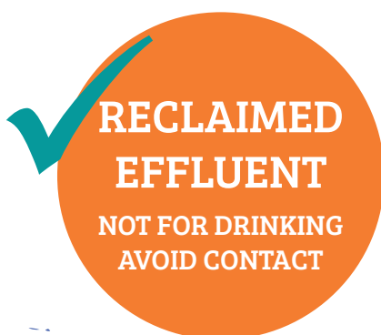
DIAGRAM 2: CORRECT SIGNAGE WORDING