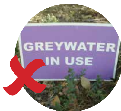
DIAGRAM 3: INCORRECT SIGNAGE WORDING