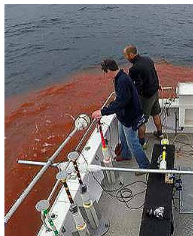
Further dye testing will be undertaken in Merimbula Bay.

For more information contact Council on 6499 2222.