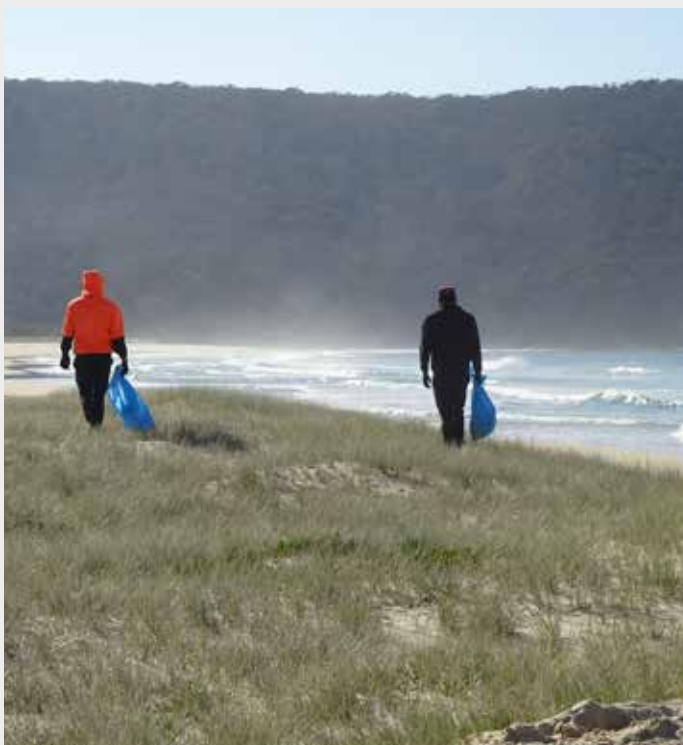
A sweep in progress at Wonboyn.