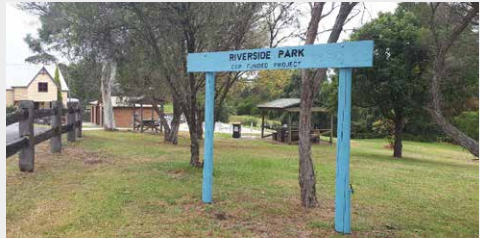
Riverside Park at North Bega is set for makeover in the next few months.