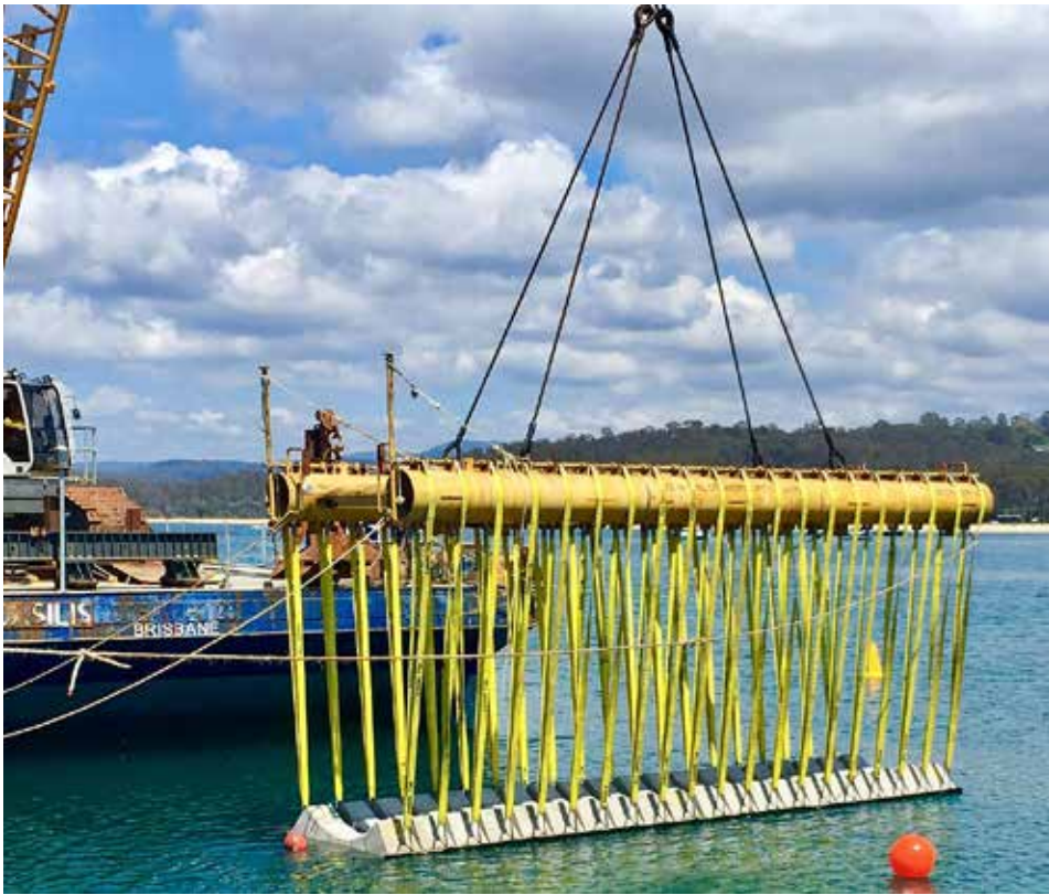
A section of scour protection being lowered into place in Eden recently.

The eagerly anticipated Eden Breakwater Wharf Extension remains on course, with the installation of scour protection completed and the marine structures contract recently awarded. Sydney-based specialist marine contractor Waterway Constructions will now extend the existing wharf by 110 metres, along with installing five berthing dolphins and three onshore bollards on the existing wharf. Upgrades will also be made to existing services, including lighting, power, potable water and emergency fire-fighting water. Navigation aids will also be installed. On-site work is relatively limited at present, with more than 2000 tonnes of structural steel and over 1000 tonnes of pre-cast concrete structural elements currently being pre-fabricated off site. An additional 2000 tonnes of concrete will be sourced from local suppliers. The community can expect to see activity ramp up over the next few months with marine plant and equipment, including crane barges, material barges, piling hammers, support vessels, scuba diving crews and drill rigs to all play a role in the construction phase. Jointly funded by the NSW Government ($32 million), Australian Government ($10 million), and the Bega Valley Shire Council ($2 million), the successful completion of the project is set to bring an estimated 80 new ongoing jobs in the tourism, hospitality and stevedoring sectors. The NSW Department of Industry is responsible for the delivery of the project, with completion scheduled for 2019.