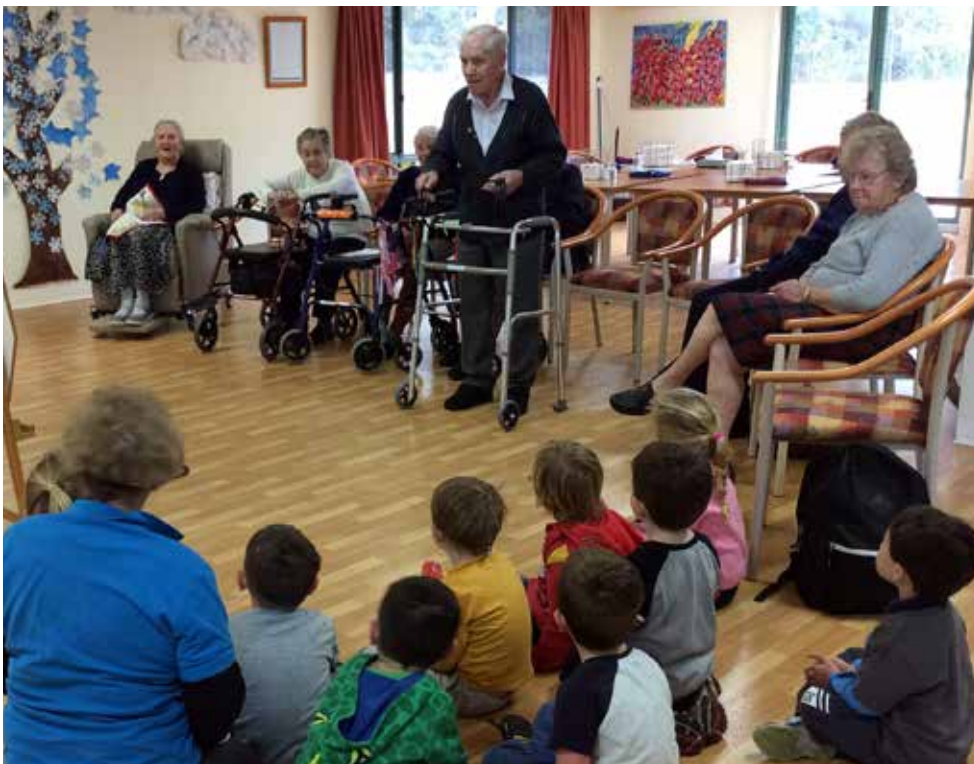
The Intergenerational Program is having a real impact in Eden.