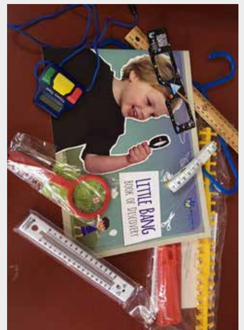
The Little Bang Discovery Club will commence at the Bermagui Library in March.