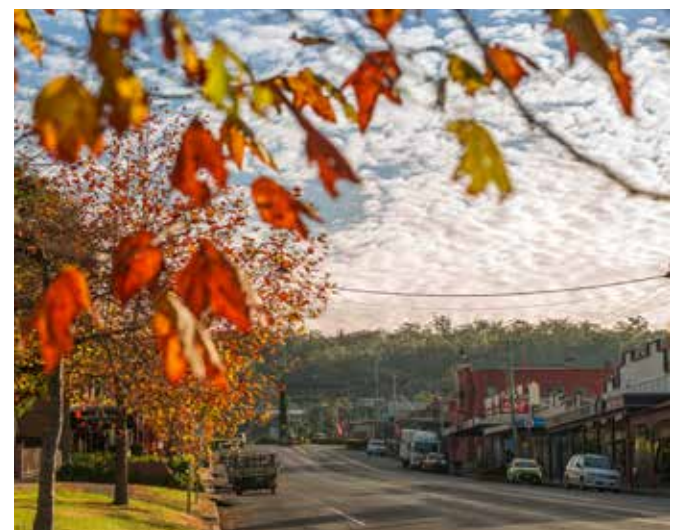
The review of Council's Draft Commercial Centres Strategy for Pambula (pictured), Merimbula and Tura Beach was adopted at last week's meeting.

It is anticipated that a further review of the Commercial Centres Strategy will commence in late 2018.