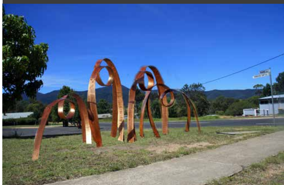
A mock-up of how 'Out for a Stroll' might look at the corner of Snowy Mountains Highway and Adams Street, Bemboka.

Bemboka has been chosen as the location for the Shire's newest piece of public art.