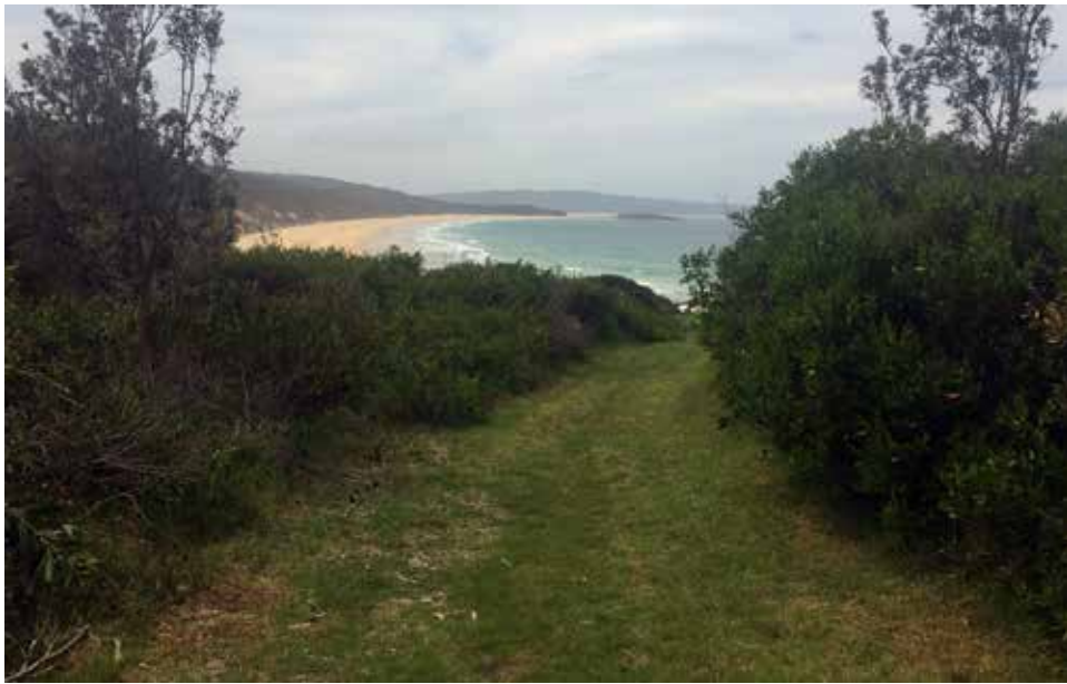
A site management plan for the Tura Head Coastal Reserve (The Point) and Dolphin Cove Reserve is being released this week.