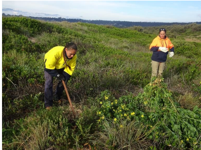
Hand removal of Bitou bush

Weed mapping extended up the Bega River estuary, including the islands that provides ground-truthed mapping for this project, Tathra Landcare volunteers, BVSC weeds staff and the Coastal Weeds project. Weeds targeted for mapping include Asparagus fern, Bitou bush, Prickly pear, African lovegrass and Mother of millions. This mapping process has improved the understanding of weed distribution, along with improving the mapping and weed identification skills of the Bega Local Aboriginal Land Council (Bega LALC) workers. The project worked from the estuary to the west of Thompson's Road, the Tathra Flora and Fauna Reserve, the estuary around Mogareeka, and south along the dunes to the caravan park. Along with the 8 days of paid bush regeneration work undertaken by Bega LALC, the Tathra Landcare Group undertook their regular monthly working bees focused on Bitou bush. The volunteer effect equated to 297 hours of bush regeneration works.