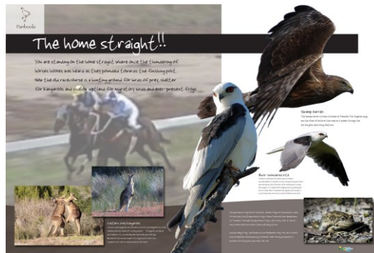
Example of one of the signs

Two signs have been successfully installed at the Old Pambula Racecourse. The signs measure 1220mm x 610mm each and have been positioned such that the viewer can look over the signs, to the landscape beyond. The signs assist with identification of ten different bird species, one marsupial and two amphibian species and highlight interesting facts about each.