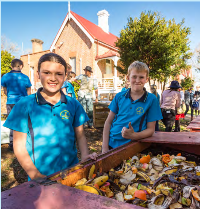
St Patrick's Primary School in Bega is one of many schools that compost and garden, supported by grants from Council's waste education fund.