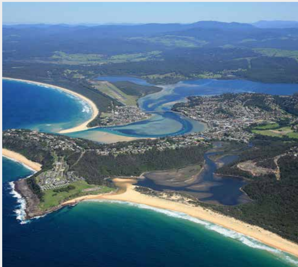
Council is seeking community input into the Merimbula Lake and Back Lake Floodplain Risk Management Study and Plan.

"This time, we're looking for information on flooding problems that people are aware of and suggestions on how they would like to see these problems addressed.