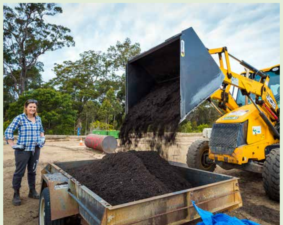
Mayor Cr Kristy McBain purchasing a load of compost for her garden. Following the recent introduction of FOGO, Council has increased the distribution of its high quality compost from two tips to four.

FOGO is part of Council's 10-year Waste Management and Resource Recovery Strategy 'Recycling the future' which aims to reduce valuable resources going into landfill.