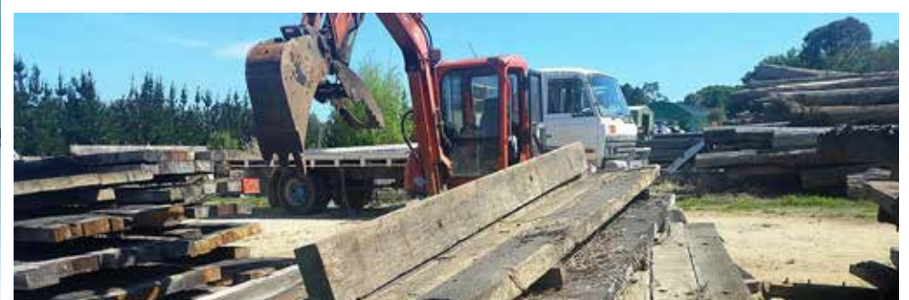
Re-purposed hardwood bridge timbers will feature on the Tathra Headland Walkway.

Funding to construct the walkway comes from the state government's Regional Growth - Environment and Tourism Fund, $1.2 million of which was committed in the aftermath of the bushfire emergency.