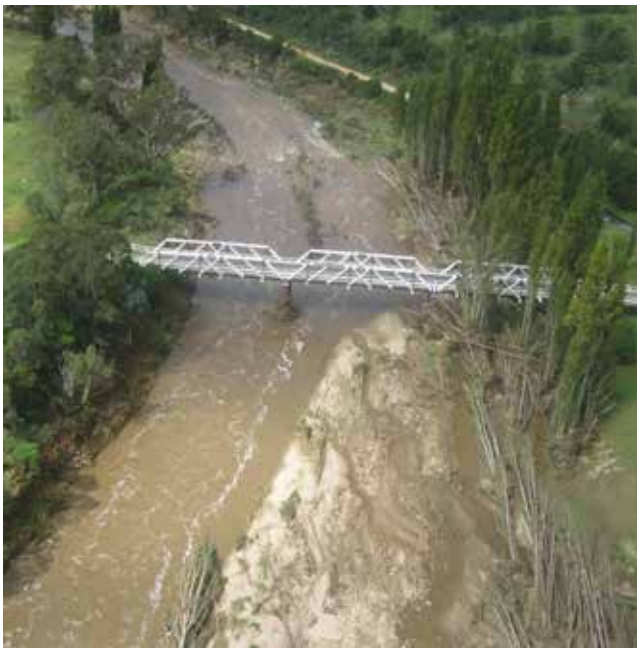
Historical data provided by the community has proven invaluable in the development of flood models for the Towamba River (pictured), Eden and Twofold Bay.

Project staff developed the flood models based