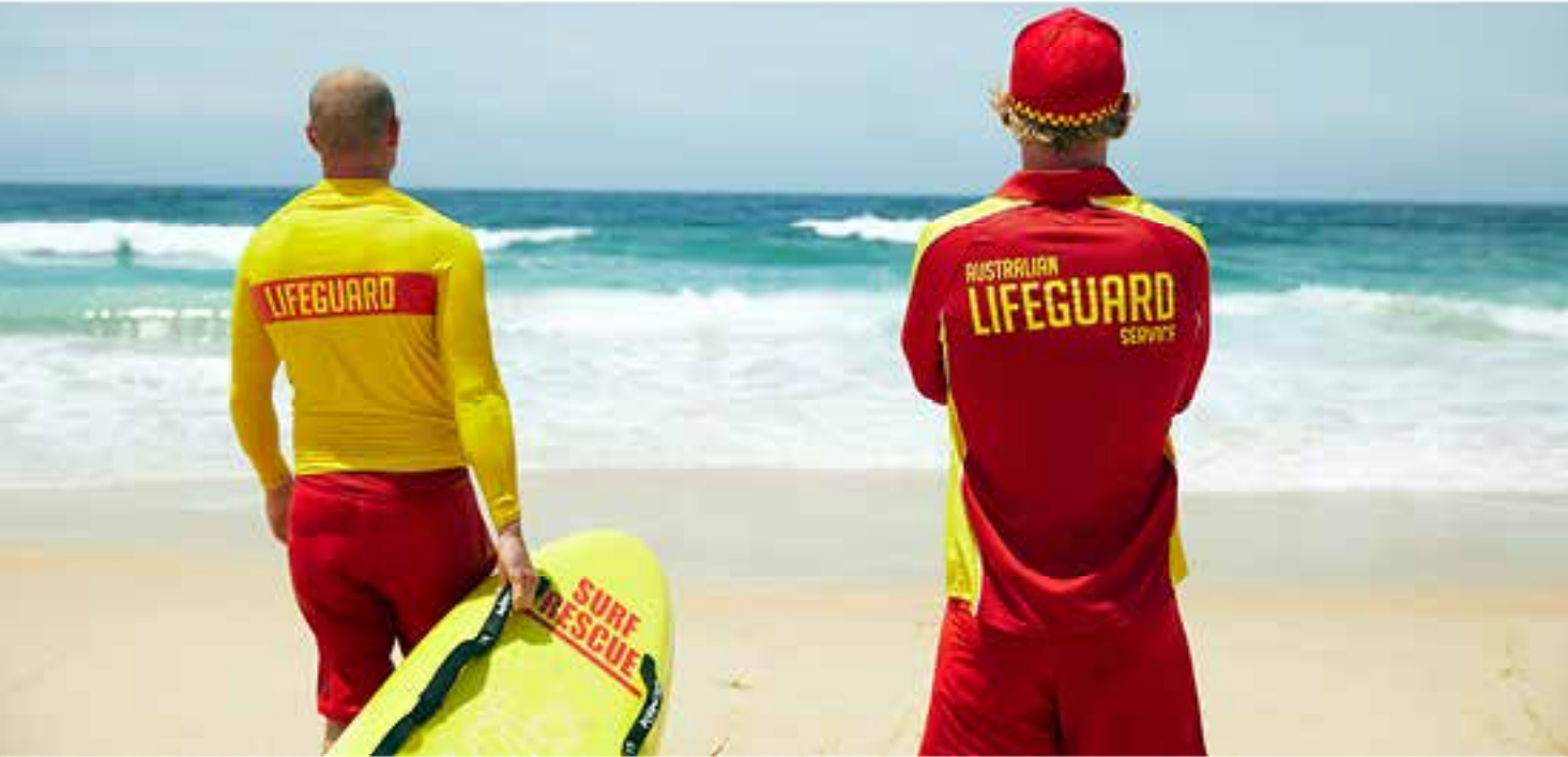
The Australian Lifeguard Service (ALS) will once again be a fixture on the Shire's beaches this summer.