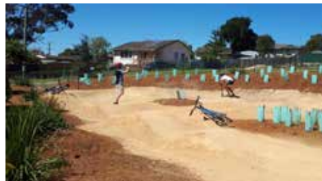
Above: The new Bike Pump Track has proven very popular.

Council will be holding a Project Closing Celebration for the community in December to thank everyone for their input into this multi-faceted project, which is an initiative of the NSW Government's Future Directions for Social Housing in NSW.