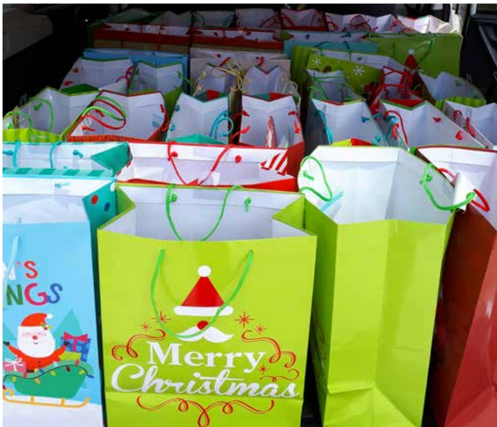
Bags of Christmas decorations packed and ready for distribution.

Thanks to a community craft group initiative, people who lost their Christmas decorations in the Tathra and District Fire will have some beautifully handmade ornaments.