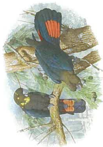
Glossy Black Cockatoos © William T Cooper

Some of the more spectacular wild flowers likely to be seen in the Reserve, mainly in spring, are shrubs such as Wedding Bush, Crimson Bottlebrush, Broadleaf Wedgepea, Tick Bush, Common Aotus, Sticky Boronia, Heath Milkwort, Correa, Heath, Guinea Flower, Thyme-leaf Tetratheca, and orchids and other wildflowers such as the Large Duck Orchid, Purplish Beard Orchid, Pink Hyacinth Orchid, Tiger Orchid, Blue Grass Lily, Paroo Lily, Purple flag, Blue Dampiera, and Trigger Plant.