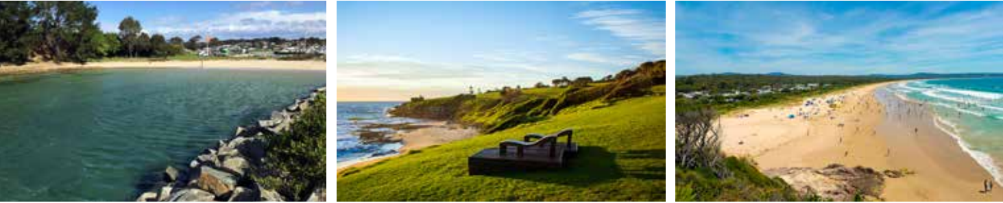
Bermagui’s Bruce Steer Pool (left), Merimbula’s Short Point (centre) and the Pambula Beach Surf Club Precinct (right) will be transformed under the Bega Valley Shire - A Destination For All project.