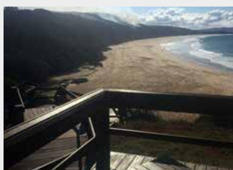
Views like this will soon be available to people with mobility limitations at the Tura Beach reserves.

A recent community survey found that track upgrades will meet