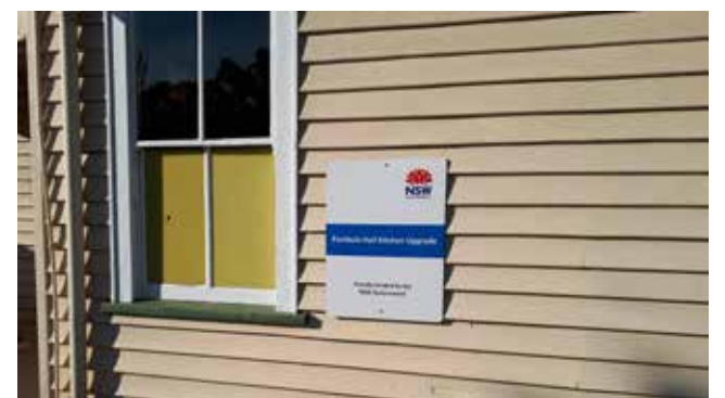
The installation of a new kitchen is underway at the Pambula Hall.

"Not-for-profit community groups could also potentially provide further services to those in need."