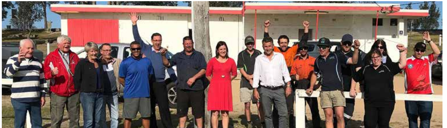
Players, club representatives and supporters are celebrating the huge funding announcement for Eden's Barclay Street Complex that will result in a new clubhouse building, new field lighting and seating and improvements to the network of paths and car parks.

The site is home to the town's Aussie Rules, Cricket and Soccer clubs and the upgrades will enable the groups to promote greater