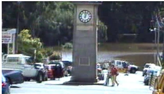
Bega River – Town Clock near Commercial Hotel