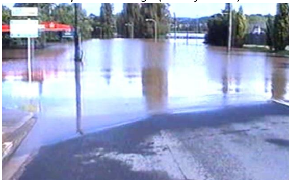
Carp Street – Bega (when flooded)