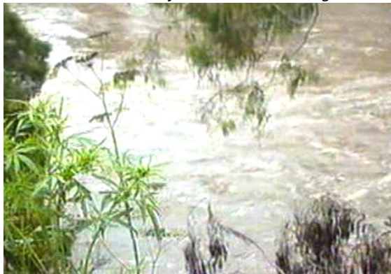
Downstream of Candelo Creek Bridge