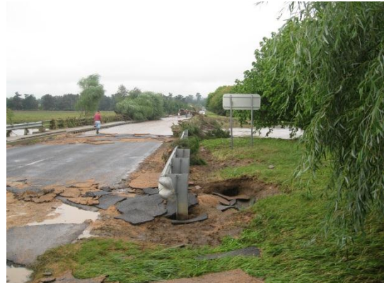
Debris at Tarraganda Lane bridge