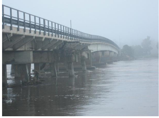
Tathra Bridge near Mogareeka