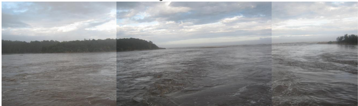
Bega River Outlet