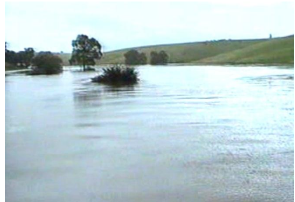
Yallumba Creek Bridge