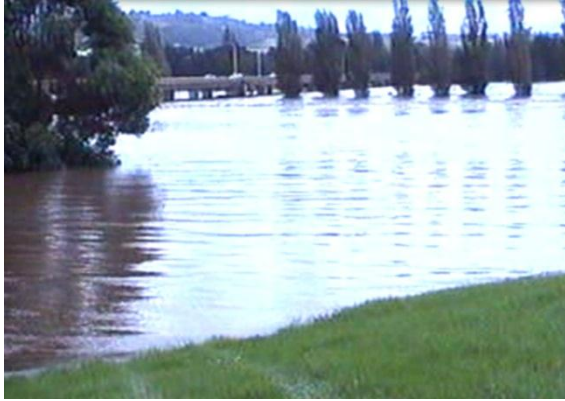
Princes Highway, Bega