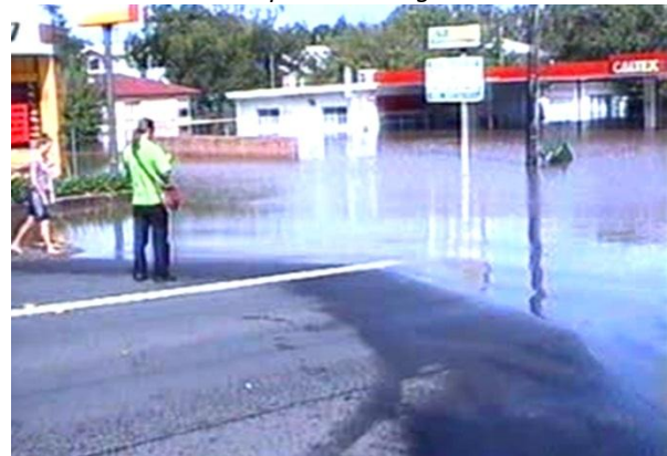
Carp Street - Bega