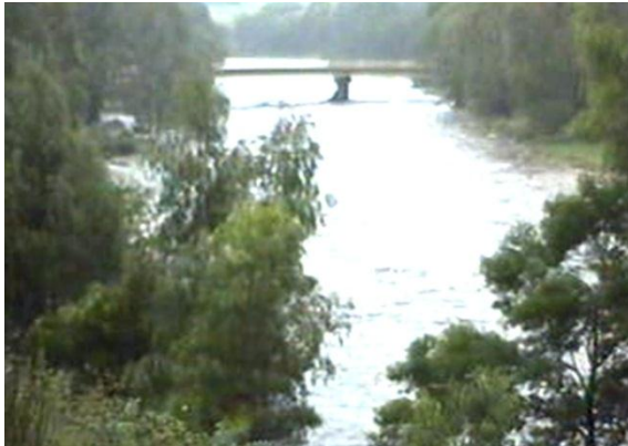
Candelo Creek Bridge