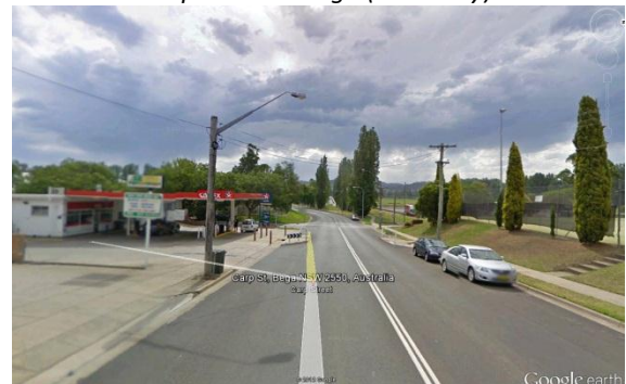
Carp Street – Bega (when dry)