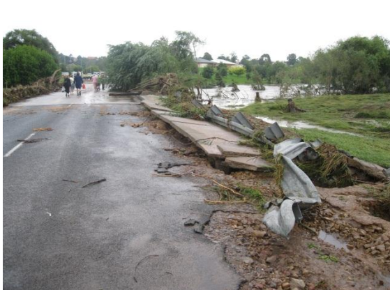
Flood Damage at Tarraganda Lane bridge