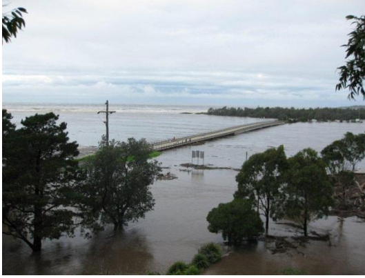
Tathra Bridge near Mogareeka