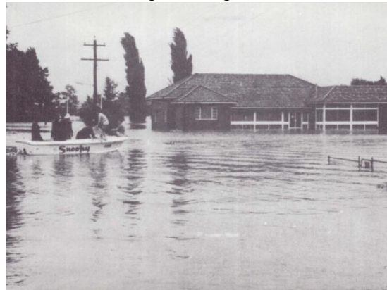
Bega Bowling Club