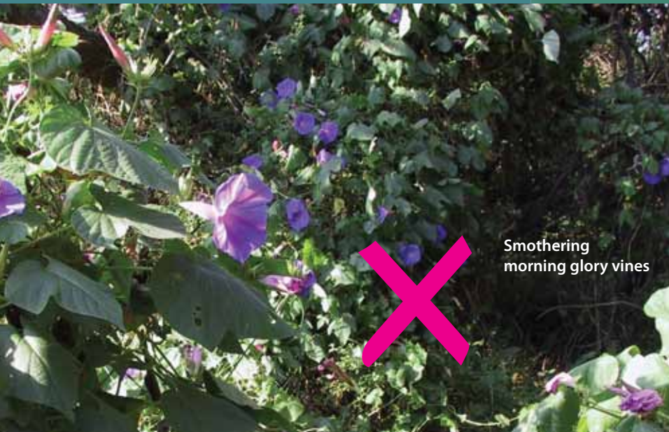
Smothering morning glory vines

Weedy garden plants cause many problems IN your garden and also OUTSIDE your garden. When they invade surrounding bushland they may