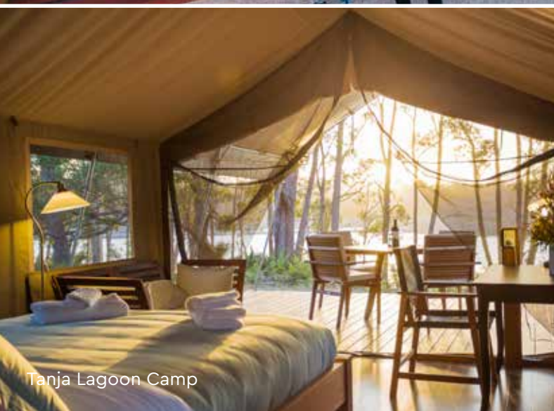
Tanja Lagoon Camp