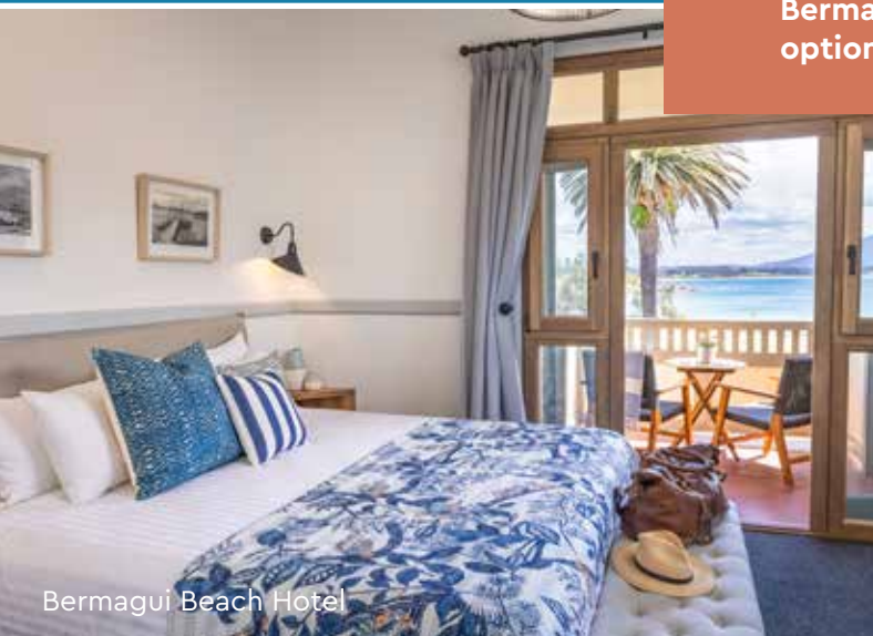
Bermagui Beach Hotel

Our main accommodation hubs are Merimbula, Eden, Bermagui, Tathra and Bega, as well as wonderful options in our smaller villages and localities.