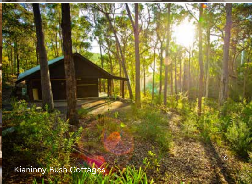
Kianinny Bush Cottages