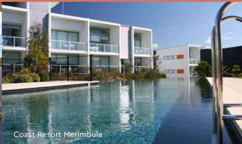
Coast Resort Merimbula