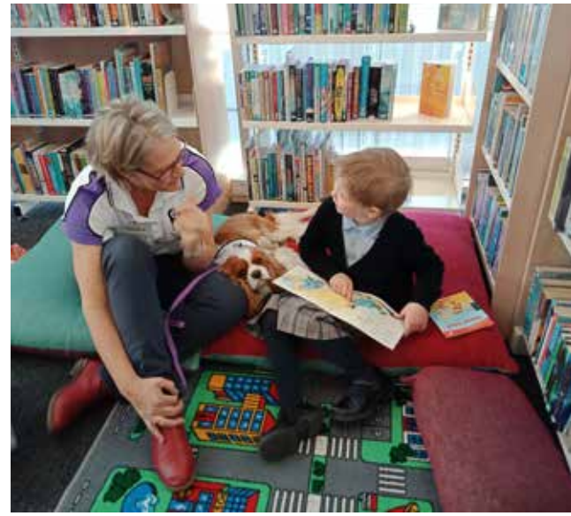
Participants of the Paws 'n'Tales program at Bowral Library.

If you would like your child to take part from