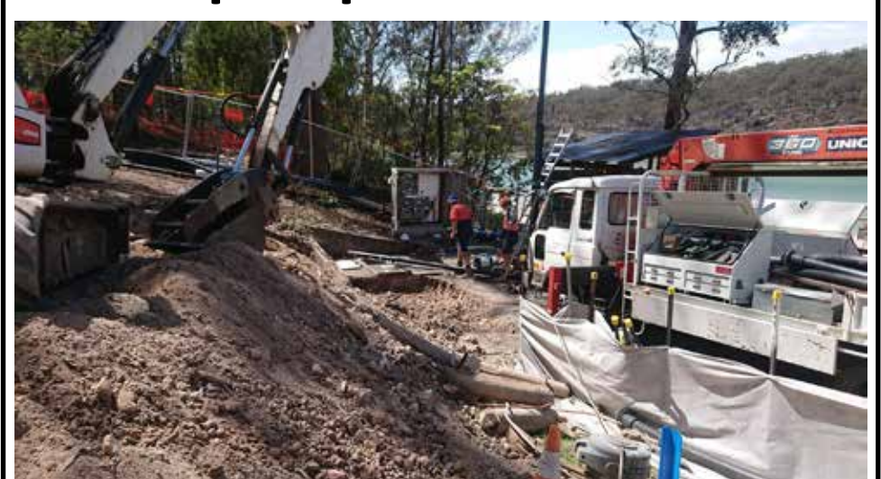
Council's sewer pump station renewal program is well underway.

Council's Sewer Pump Station renewal program is in full swing, with the Pambula Beach area currently coming in for attention.