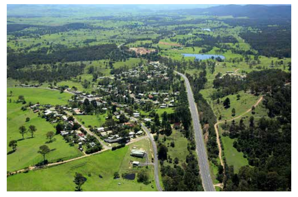
Council adopted the new Rural Residential Strategy last week.

development across the Shire will be able to meet demand to 2040 and suitable future growth areas.