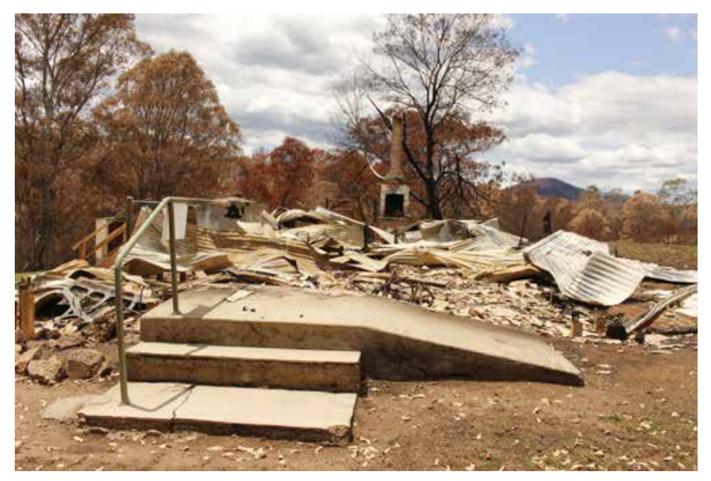
Council recently resolved on a number of measures to further support those impacted by the busfire disaster, including establishing a framework for minimising and waiving rates, fees and charges.

"The NSW Government has also waived applicable government fees, effective immediately, on all development applications related to dwellings damaged or destroyed