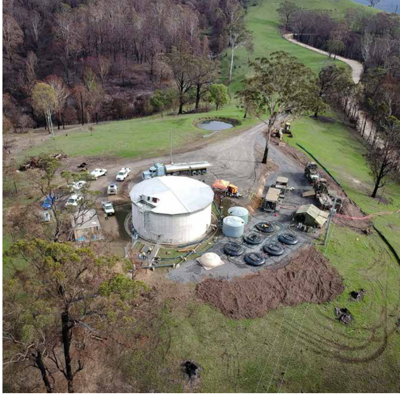
The ADF have set up a water purification and desalination system (WPDS) next to Brogo Tank One to help supplement the drinking water supplies.

"Although this is still not our normal operating situation the need for water restrictions is no longer there right now – and no boil water notice