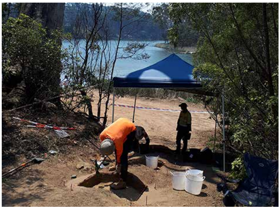
Council's Recreation and Natural Assets team is busy getting on with the job of delivering projects across the Shire. Here Aboriginal Heritage salvage work is being undertaken at Blackfellows Lake (Kalaru) ahead of the planned boat ramp upgrade.

Along with the Apex Park in Cobargo, the Lions Park at Mogareeka will also come in for a facelift, with the Wyndham and