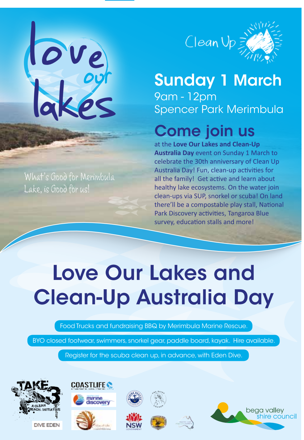
Page 7 - Council News - A Bega Valley Shire Council publication

"The GIVIT platform is free to use, so check it out today and help make a genuine difference to bushfire affected communities."