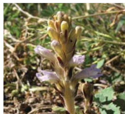
Broomrapes Orobanche species Prohibited Matter A serious parasitic crop weed