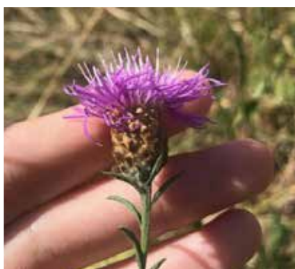
Black knapweed Cenaturea X moncktonii Prohibited Matter A serious crop weed.

Prohibited Matter MUST be reported under the Biosecurity Act 2015