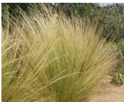
Mexican feather grass Nassella tenuissima Prohibited Matter Highly invasive grass