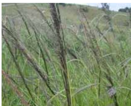
Giant rat's tail grass Sporobolus pyramidalis Invasive grass that reduces production