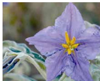
Silverleaf nightshade Solanum elaeagnifolium Weed of National Significance