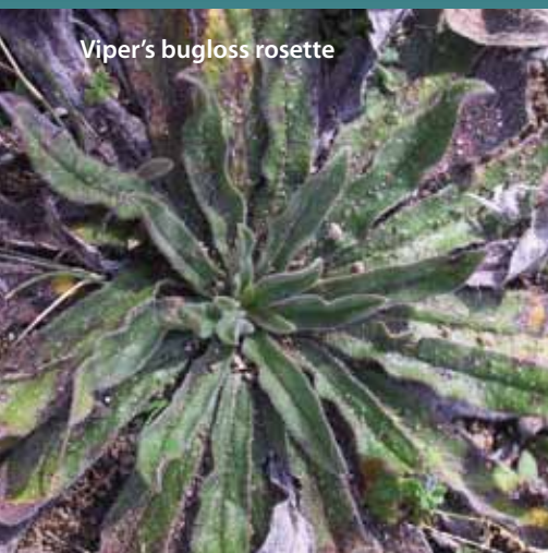
Viper's bugloss rosette