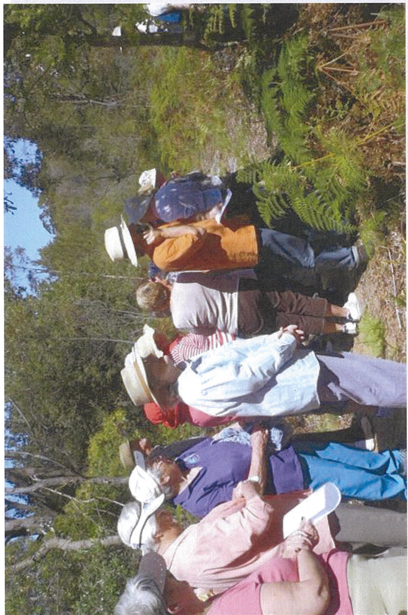
A group of visitors in the Reserve enjoy a guided tour on one of the Open Days organized by the management committee

Guided tours are organized on Open Days so that interested groups and the public can enjoy this amenity and its educational potential.