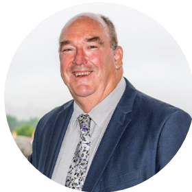
Cr Russell Fitzpatrick Mayor