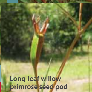
Long-leaf willow primrose seed pod