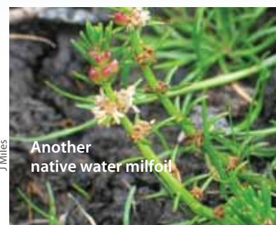
Another native water milfoil