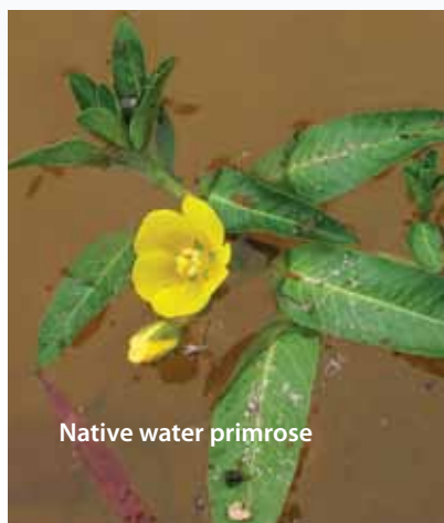
Native water primrose

A native aquatic herb, water plantain ( Alisma plantago-aquatica ) is quite similar to sagittaria, but its flowers are much smaller (10mm across) and carried in larger numbers in large, widely branching heads above the leaves. In the photo comparing two leaves below, sagittaria is on the left and water plantain on the right. The fruits of water plantain are much smaller than those of sagittaria and are ribbed, not warty in texture (below right).