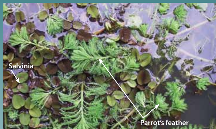
Parrot's feather ( Myriophyllum aquaticum )

Parrot's feather ( Myriophyllum aquaticum ) is a submerged or floating water plant with feathery blue-green leaves and inconspicuous flowers which are produced singly in the leaf axils. It may also grow on mud around the edge of water bodies, or persist on mud as ponds shrink during drought (below right) and the upper stems may emerge vertically above the water surface for about 10 cm as well.