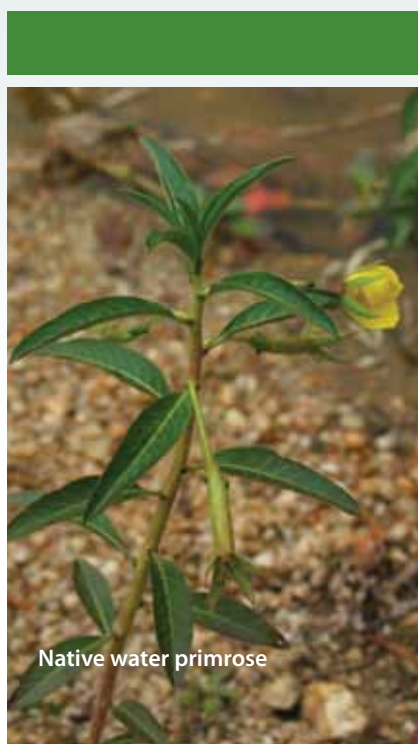
Native water primrose