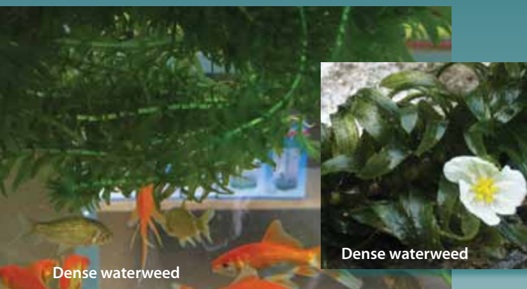
Dense waterweed ( Egeria densa )

Dense waterweed ( Egeria densa ) grows fully submerged in the water, although the white, 3-petaled flowers are held above the water surface on slender thread-like stems. The plant is rooted in the mud and has stems to about 1.5 metres long, which are ringed by close-packed whorls of 3-8 leaves.