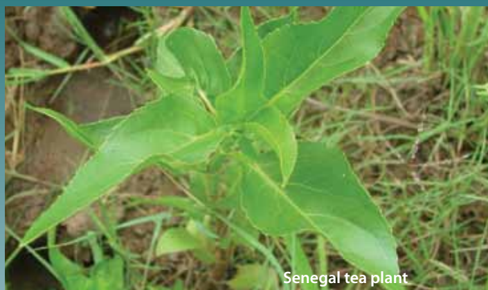
Senegal tea plant

Some aquatic weeds are very similar to native aquatic plants and identification may require specialist knowledge. Many are notifiable weeds (listed as Class 1 or 2 noxious weeds in NSW). Many aquatic plants, introduced into Australia as ornamentals, have been sold for use around water features or in aquariums. They can be spread by dumping or by water birds if planted in the open air. It is illegal to sell or cultivate any of the weeds described on this page.