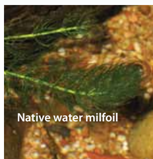
Native water milfoil

Native water milfoils ( Myriophyllum species) could be confused with parrot's feather but none of the natives have the blue-green leaves of parrot's feather and most are smaller. The photo above shows parrot's feather on the right and a native water milfoil at left. Both can grow either submerged or on mud. Native water milfoils tend to have feathery submerged leaves (left) and narrow cylindrical emergent leaves at the stem tips, which are held above the water surface, with flowers in the leaf axils (right).