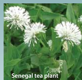
Senegal tea plant

Senegal tea plant ( Gymnocoronis spilanthoides ) is a perennial herbaceous plant in the daisy family which forms a rounded clump, or as it spreads, a tangled sprawling mass. The hollow stems are erect initially but become creeping, especially when spreading over the water surface. Leaves are opposite, elongated, with toothed edges, and hairless. Heads of small, white to mauve, fluffy flowers are held in short-branched terminal clusters.