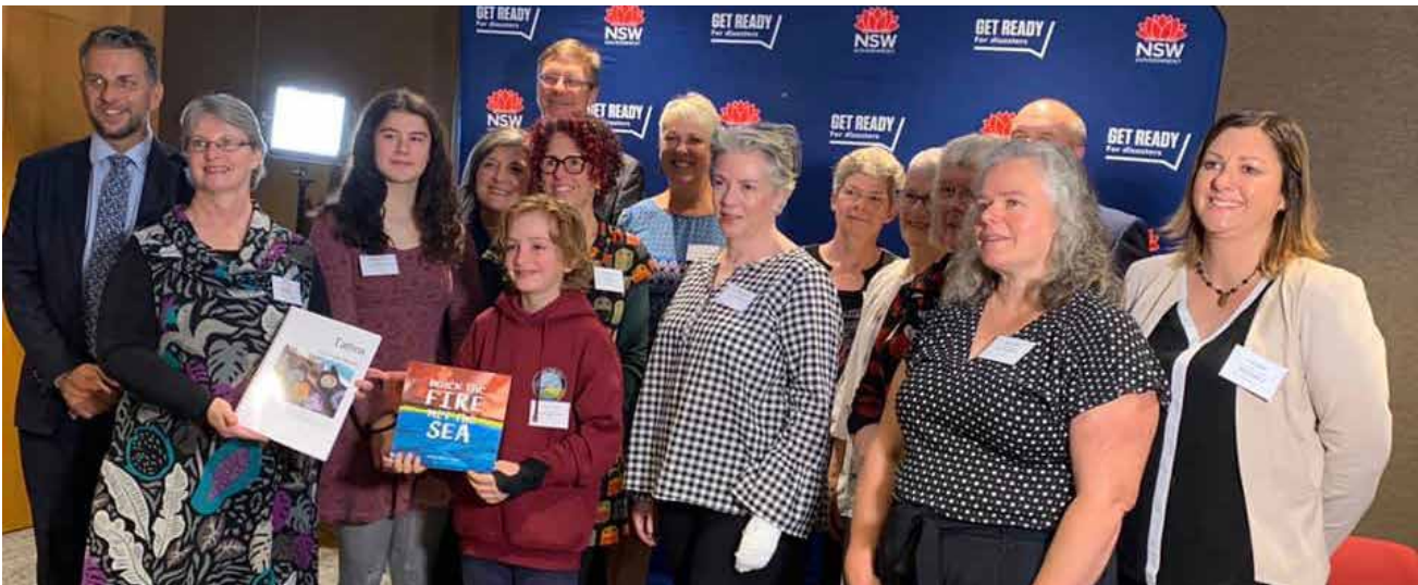
Locals were acknowledged at the Resilient Australia Awards, NSW Division recently.

The Tathra and Region Chamber of Commerce won the business category for the Tathra-Sapphire Coast Tourism Resilience Project, capturing learnings from the Tathra and District Bushfire to help local businesses plan and