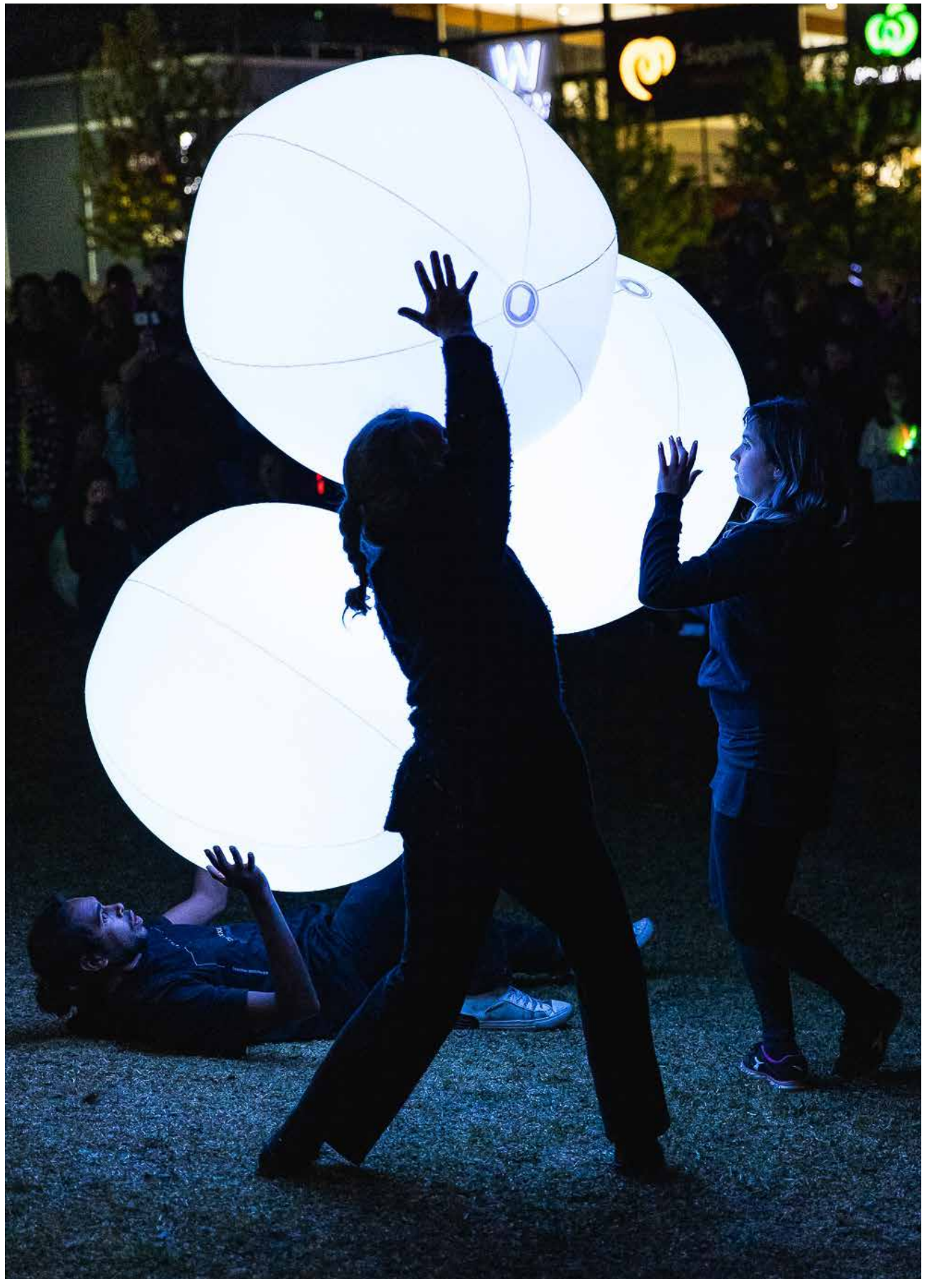
Hundreds of people filled Littleton Gardens to take in the light, sound and performances that made up the spectacular Parklight event - an initiative of the Bermagui Create & Make Crew.

The Create & Make Crew is a Bega Valley Shire Library program funded by a Youth Opportunities Grant from NSW Families and Community Services.