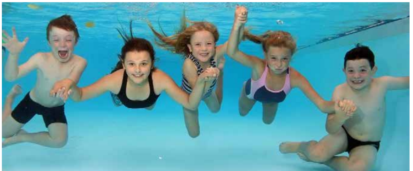
We are seeking feedback from the community on the future of our pools.

"Our six public swimming pools were built over the last 60 years and with two facilities due for renewal in the next ten years, as well as managing smaller cost asset renewals across the remaining four sites, Council has significant