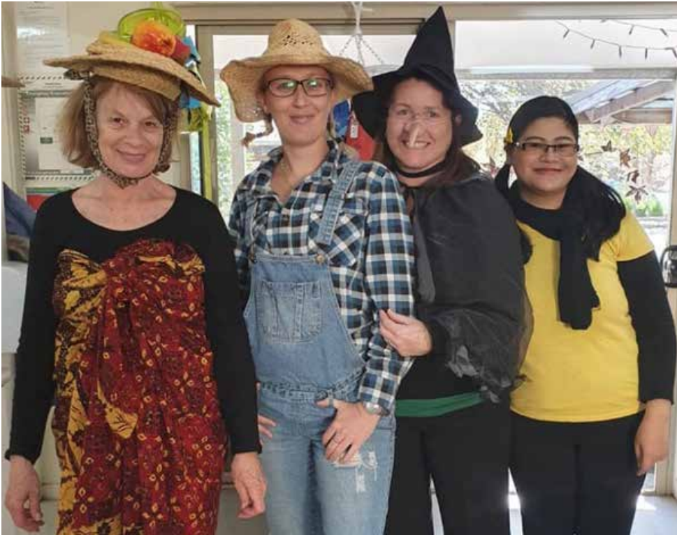
It has been big month in our early learning centres, with Early Learning Matters Week and day of recognition dedicated to Early Childhood Educators both both celebrated.