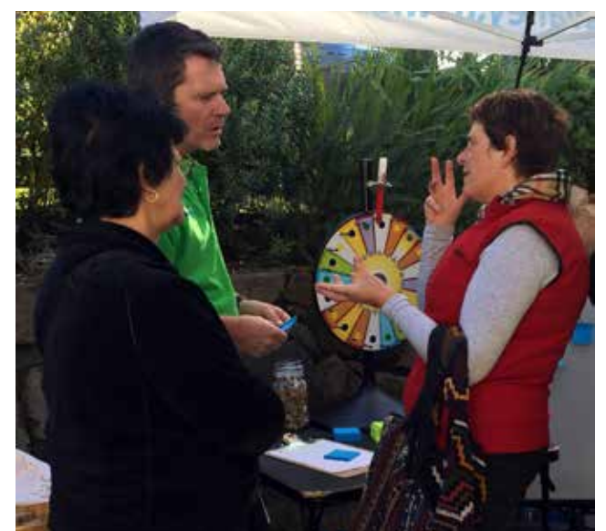
Have your say on the draft Community Engagement Strategy currently on exhibition.

Submissions close on Monday 21 October at 5.00pm.