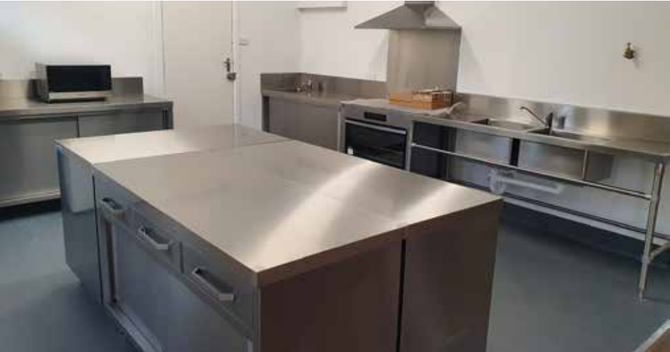
Brogo Hall’s new kitchen increases options for events and catering.

Alterations involved removing the old kitchen, patching and painting walls, installing flooring, upgrading electrics and plumbing, installing new stainless steel benches, sinks, tape ware and cabinetry, and providing new appliances.