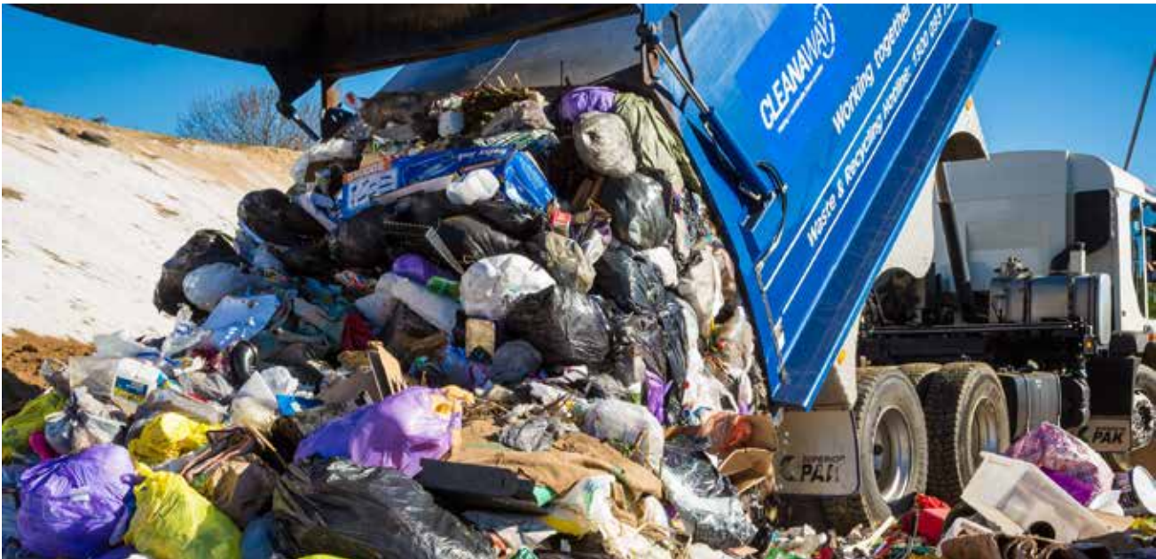
The nappy trial is part of Council's Waste Management and Resource Recovery Strategy, Recycling the Future (2018-2028), which is committed to introducing environmentally sustainable methods for managing waste into the future.

"The South Australian government's Zero Waste SA estimates about 800 million disposable