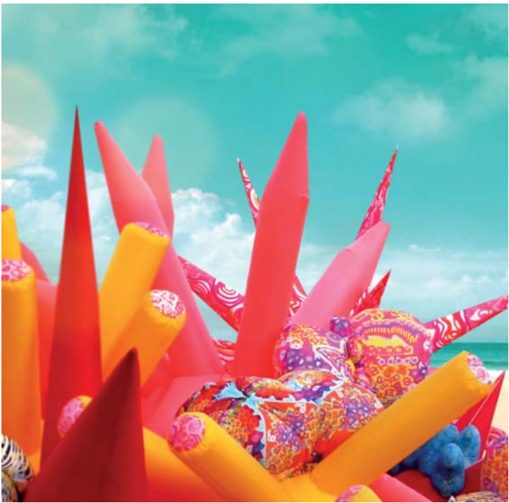
Microcosm will adorn the sky above the Bega Valley Regional Gallery from 17 May. The installation is brought to you by Goldberg Aberline Studio (GAS), who create large scale works of public art using a variety of mediums.

Microcosm will hang above the BVRG on display 24/7