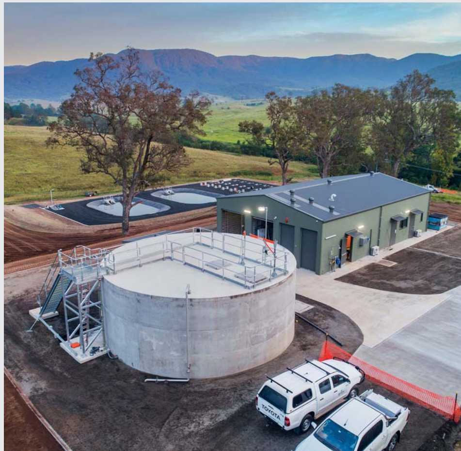
The community is invited to attend an Open Day at the new Bemboka Water Treatment Plant on 1 June.