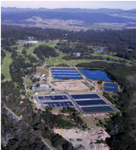
Council is offering tours of the Merimbula Sewage Treatment Plant on 25 May.