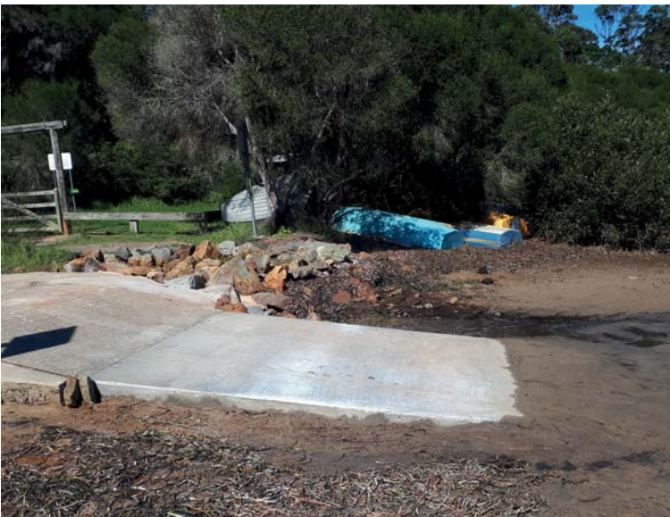
The Top Lake access ramp in Merimbula is now far more user friendly after work to reduce the steepness of the ramp and the step at the end was undertaken recently. Before (left) and after (right).