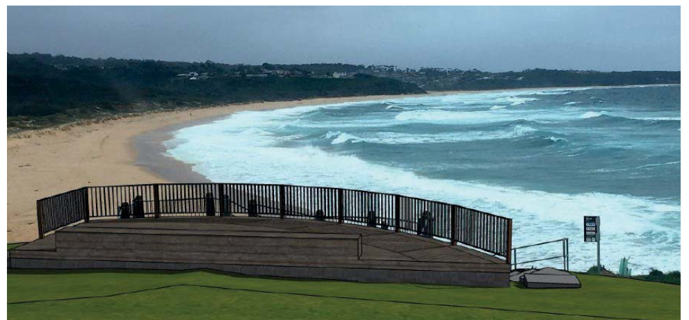
Construction has commenced on a new viewing platform at Merimbula's Short Point. The design stems from community consultation undertaken in 2018.

Visit https://bv.lyte.link/3438/4B5D for more information.