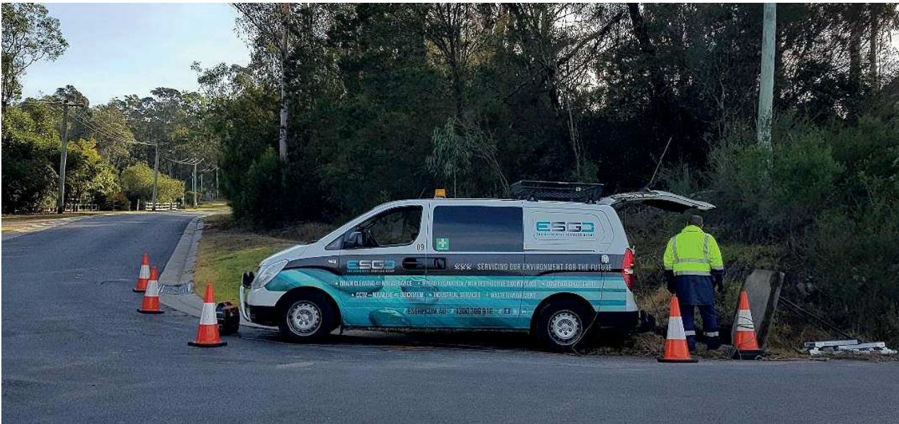
An inspection program of the stormwater network is set to commence next week.

The contractors will gain access via the tractor mounted CCTV unit from access chambers in the road reserve wherever possible, however where level changes occur between pipes this is not always possible.