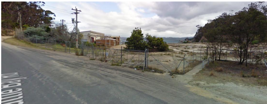
Photo-Proposed Site Entrance Cattle Bay Road