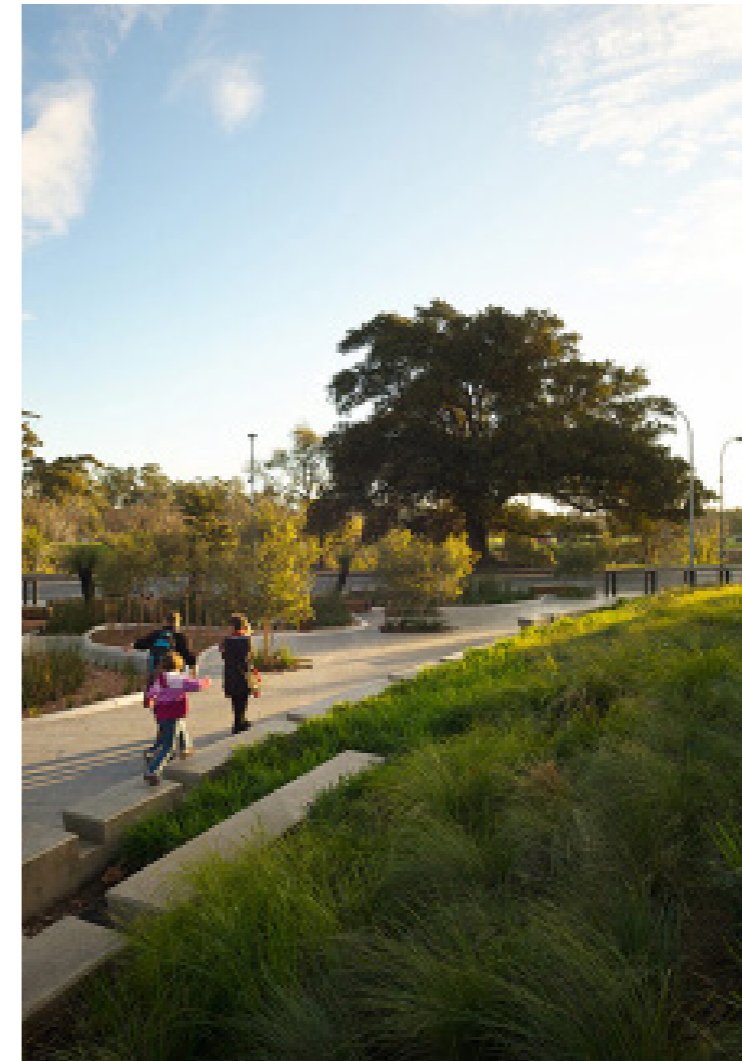
Path edged with garden bed