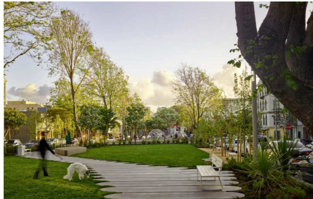
Path bleed into lawn