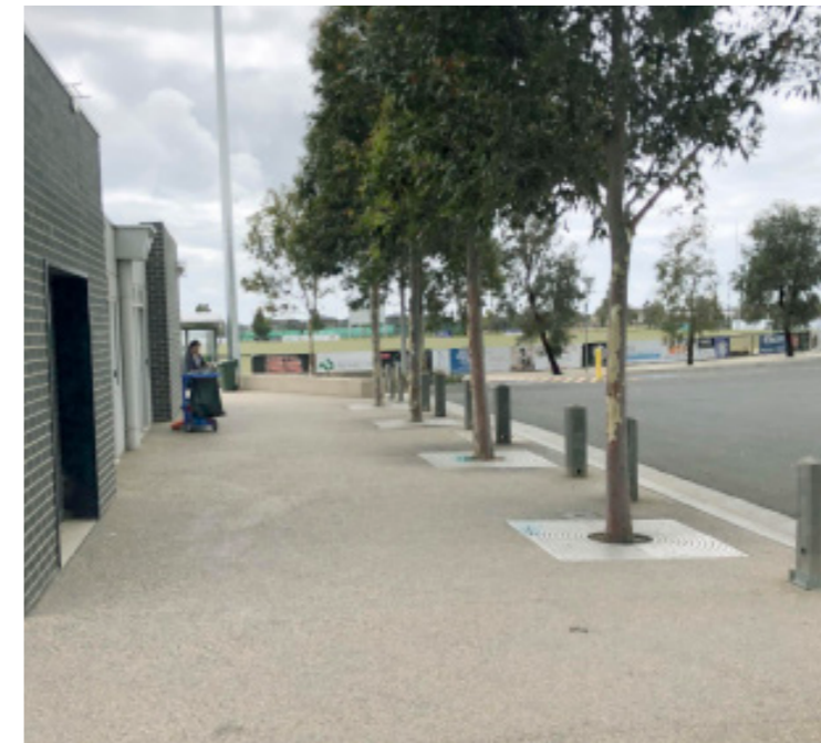
Mixed user paved paths