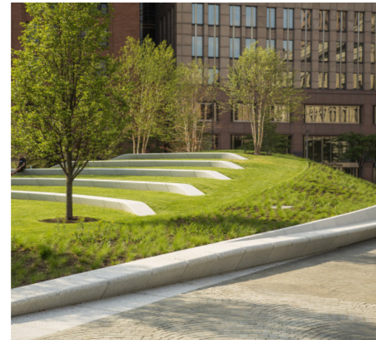
Earth mounding for seating