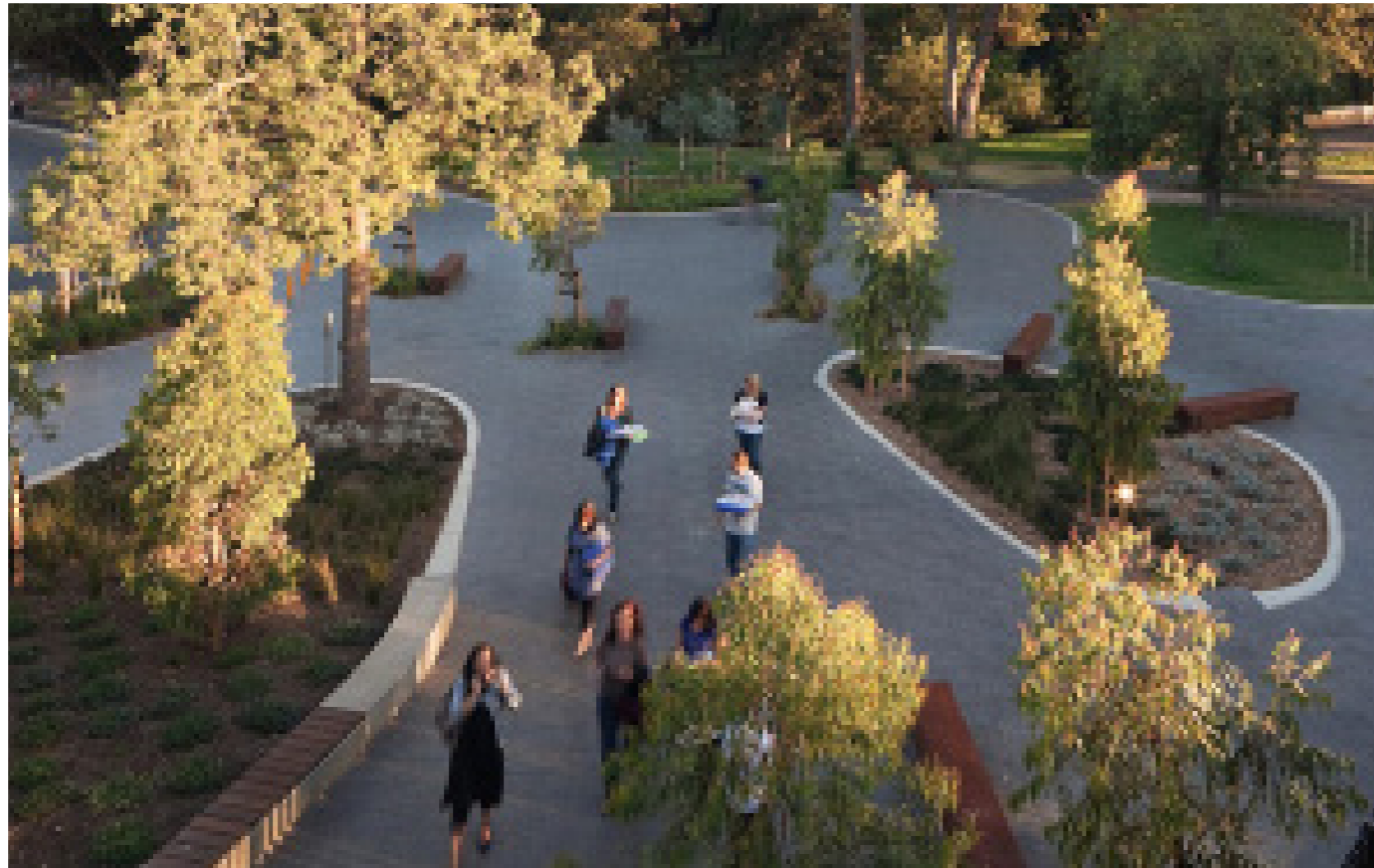
Paved gathering space