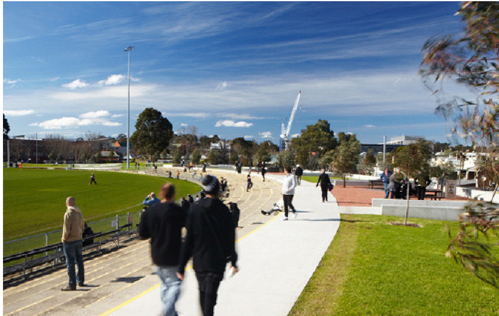
Path networks with ambient spectator lawn in Abbotsford, VIC