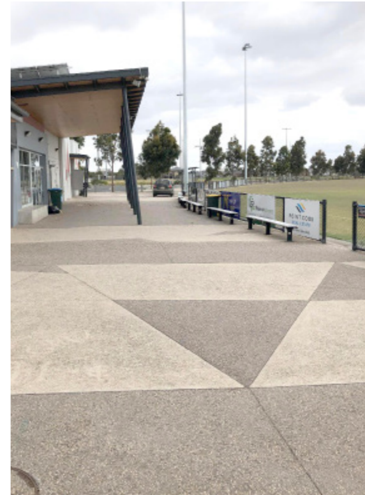
Active pavilion interface with room for vehicle