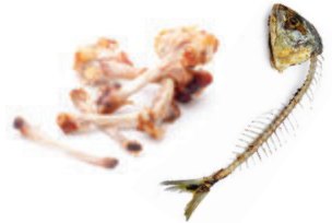
Meat, bones and seafood