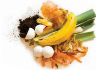
Food waste including fruit, vegetables, bread, rice, pasta and coffee grounds