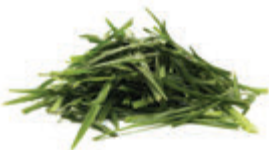
Grass clippings and weeds