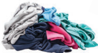
Clothing and textiles