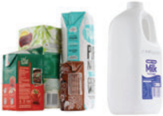
Milk and food/juice cartons