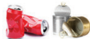
Aluminium and steel cans