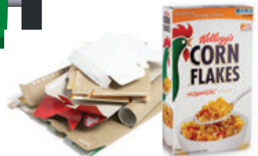
Clean paper and cardboard