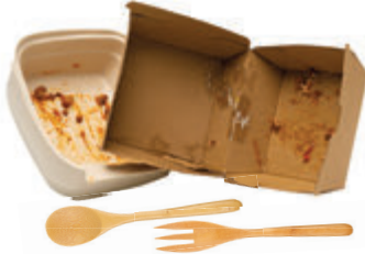
Items and packaging labelled compostable or biodegradable