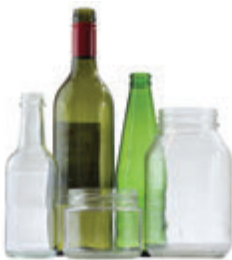
Glass bottles and jars