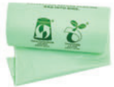
Certified compostable caddy liners