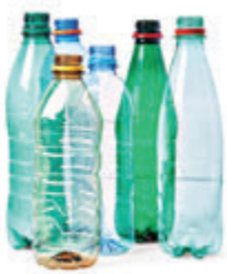
Plastic bottles and containers