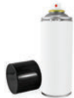
Aerosol cans (empty)