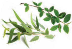
Plants and shrub prunings