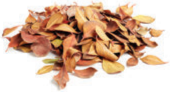
Flowers and leaves