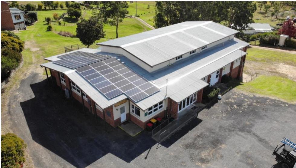
Bemboka Hall with 17 kW of solar PV and 13.5 kW Tesla battery

The positive public health preparedness outcome delivered by the project includes raising community awareness of the dangers of extreme heat and the role of their local hall as a safe refuge during extreme weather and other emergency events.